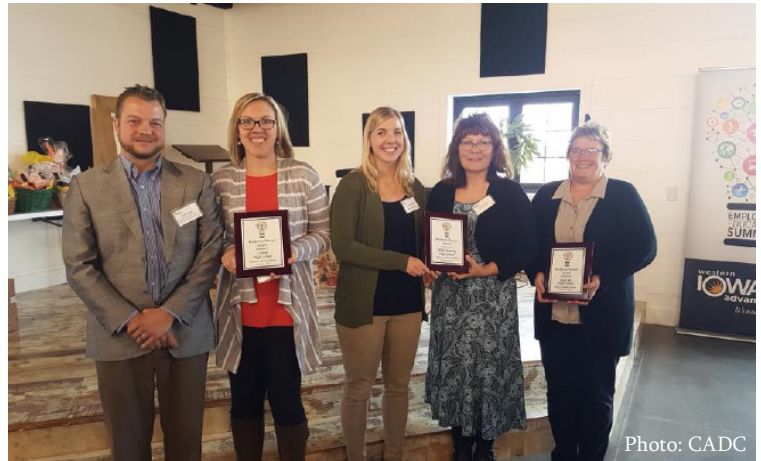
Above: Carroll Community Schools and IKM-Manning Community Schools, recognized as the 2017 Workforce Warrior Educators Below: New Hope Village, recognized for their collaboration efforts with the 2017 Workforce Warrior Award

New to this year's summit was the awarding of the Workforce Warrior awards. These awards promote collaborative efforts between local educators and businesses. Recipients were recognized for going above and beyond to work together. This year's school winners were: East Sac County High School for their School to Career Program, Carroll High School for their Employer/Educator Connection, and IKM-Manning for their STEM BEST FIRE Program. This year's business winners were: Crawford County Hospital for their RN Preceptorships, Eventide Lutheran Home for their Job Corps, WITCC & Denison Schools Partnership, and New Hope Village for their Rolling in the Fun, partnership with DMACC. Each of the award recipients received a small stipend for their efforts.