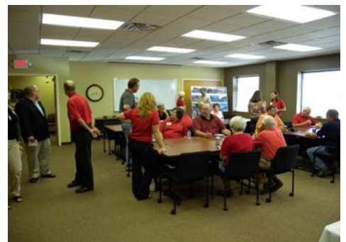
Above Left: The COG's Executive Board meets in the new board room during the COG's open house.